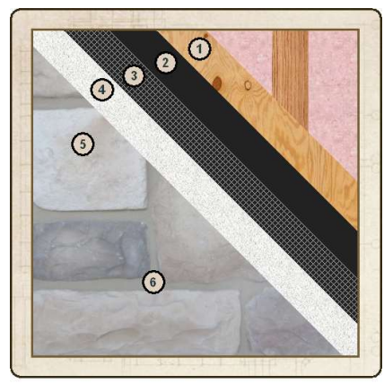
Rigid backwall (sheathing, in this example), 2 weather-resistant barrier, 3 metal lath, 4 mortar setting bed, 5 manufactured stone, 6 mortar joint.

Rigid Backwall This substrate includes such surfaces as sheathing<sup>2</sup>, paneling, plywood, sheetrock, and wallboard.