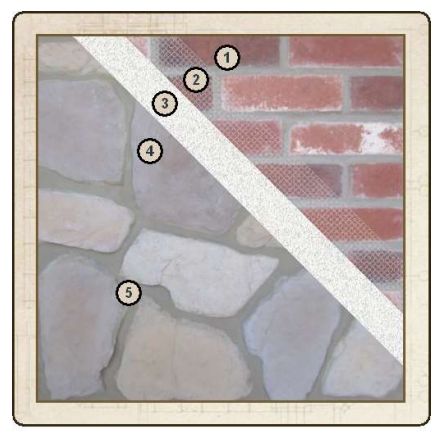
Painted or sealed masonry or concrete, metal lath, 3 mortar setting bed, manufactured stone, 5 mortar joint.

Treated Masonry This substrate includes all masonry surfaces such as brick, block, CMU, stucco,